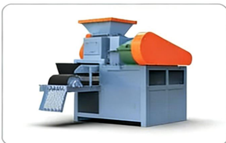
压球机 CHARCOAL BALL BRIQUETTE MACHINE