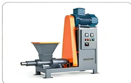
木炭机 BIOMASS EXTRUDE MACHINE