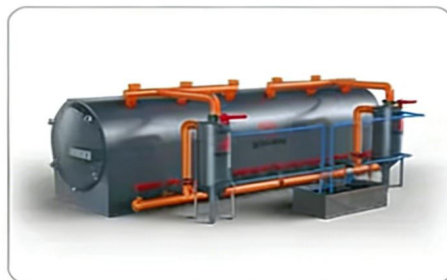
卧式炭化炉 HORIZONTAL CARBONIZATION FURNACE