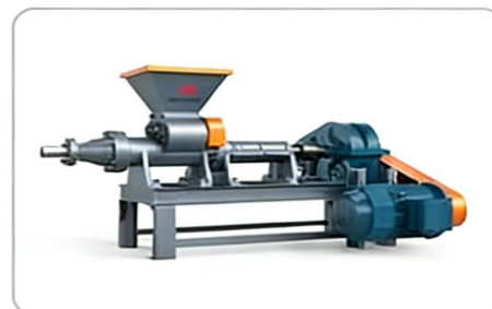
煤棒机 CHARCOAL EXTRUDE MACHINE