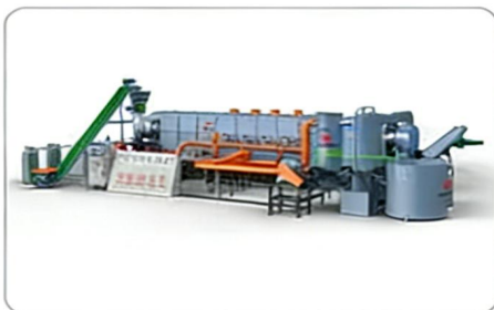
连续式炭化炉 CONTINUOUS CARBONIZATION FURNACE